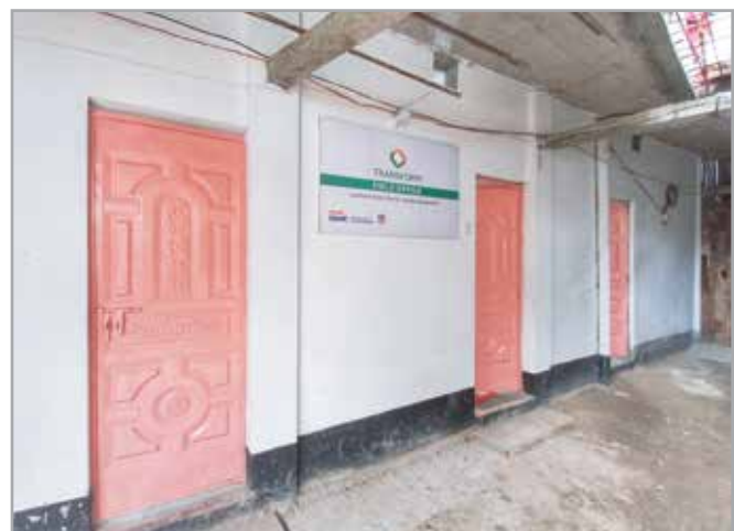
TRANSFORM Field office in Korail, Dhaka

Telepsychiatry Research and Innovation Network (TRIN) established an office inside the Korail slum to earn the trust of the community and to establish connectivity with the community stakeholders and community people. As a part of this, six community workers are recruited among the residents of Korail slum. They are helping the field research team members to identify respondents and connect with the community. Few research team members are working at this field office regularly.