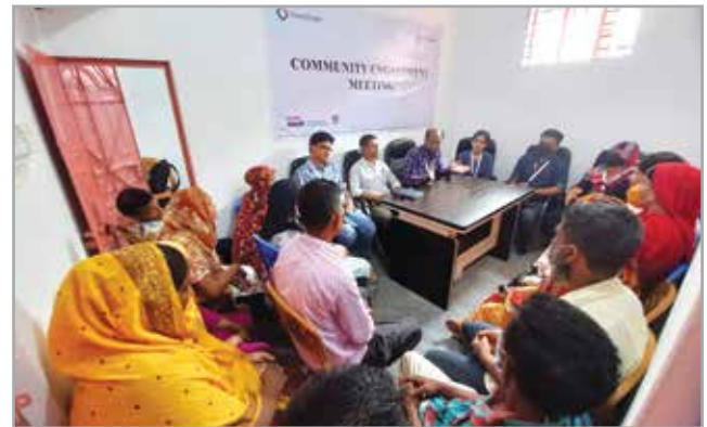
Meeting with community members and caregivers

A series of community meetings were held with different stakeholders including community members and caregivers of persons with serious mental disorders living in the Korail slum, respected persons and leaders including political, religious, and faith-based leaders, health care professionals, and other stakeholders (government organizations, international organizations, local non-government organizations, different universities). The meetings were participatory and almost all meeting participants shared their thoughts and feedback on the program.