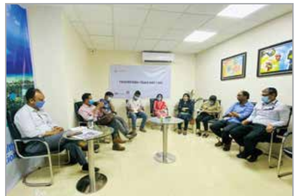
Weekly Coordination Meeting at TRIN office

Team coordination meetings take place every Monday at the Telepsychiatry Research and Innovation Network (TRIN) Conference room. The purpose of the meeting is to discuss the activity plan and to review the status of the activity scheduled. Along with the TRANSFORM team, the meeting is also attended regularly by the members of the partner organization - Bangladesh Center for Communication Programs (BCCP). In this quarter (April-June), 12 coordination meetings were held at the TRIN office.