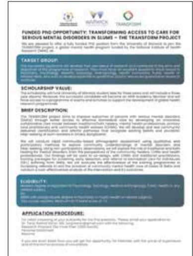
PhD fellowship circular details

TRANSFORM Project offered a fully funded PhD opportunity from the University of Warwick to join the TRANSFORM Project. The scholarship will fund student fees for three years. The successful applicants will develop their piece of research and contribute to the aims and objectives of the research program. Moreover, the successful candidates will become an NIHR Academy member and will have access to events and activities to support the development of the global health research program.