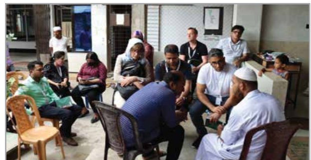
Meeting with Community People