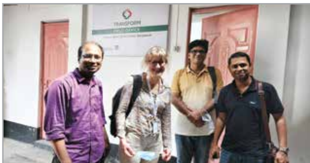
TRANSFORM field office visit