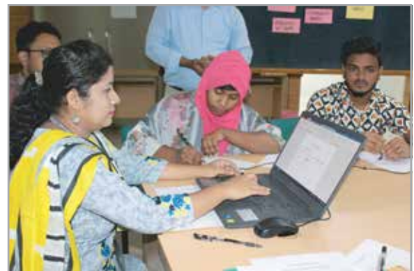
Group Work in Message Development Workshop

The workshop was engaged by 14 participants including clinic managers, community health workers (CHWs), youth leaders, community leaders, script writers, and designers along with mental health experts. A combination of Reflection, Discussion, and Synthesis (RDS) methodology was applied in the workshop that led the participants to follow through with the presentation, discussion, question-answer, group work, and group presentations. The group work found key message themes for 3 basic SBCC materials of posters, banners, and leaflets for the target audience groups of community people, parents, slum dwellers, community health workers, and community leaders.