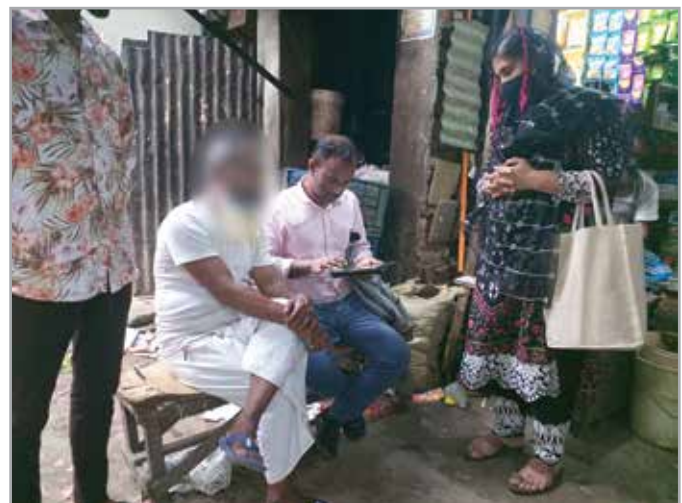
Data Collection Monitoring at Korail Slum for Service Delivery Mapping

A total of 211 facilities including 50 schools, 19 madrasas, 20 religious' institutions (19 mosques and 1 temple) 2 clinics, 13 doctor's chambers, 66 pharmacies, 5 NGOs, 24 traditional healers, and 7 shrines were identified through service delivery mapping. The study team also prepared a social map engaging slum leaders of different parts, students, and general people of Korail slum which is basically used to triangulate the numbers of service delivery data.