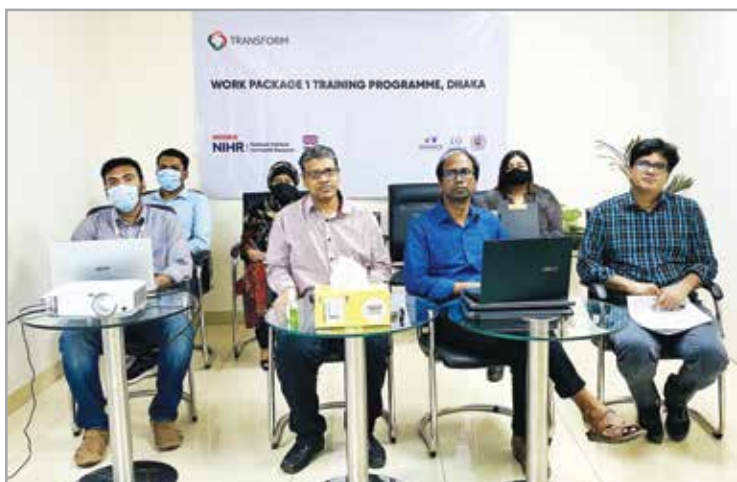
Bangladesh Field Research Team