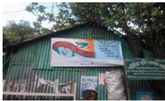
Photo 15: Banner displayed at Korail slum

level. Besides that, outreach activities like displaying posters and banners in the strategic points of Korail slum. Around 500 posters and 60 banners displayed focusing the information of informing about SMD symptoms, taking care of SMD patients, and scientific medical treatment. The project also developed newsletters and brochures and sent it to government, NGOs, Academic institutions and policy makers in a regular manner both electronically and hard copy to keep update about TRANSFORM Project.