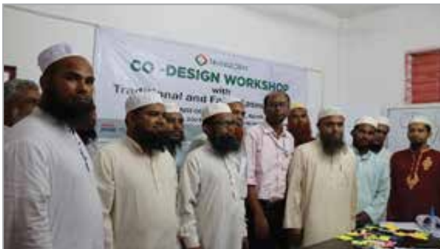
Photo 1 Co-design workshop with religious leaders

A series of Co-design workshops were organized between May and June 2023 to engage community stakeholders in the designing of training modules for community health workers (CHW) and traditional and faith-based healers (TFH). A total of 46 community members attended 5 workshops including 12 traditional and faith-based healers, 12 local medicine sellers, 12 individuals with lived experience,