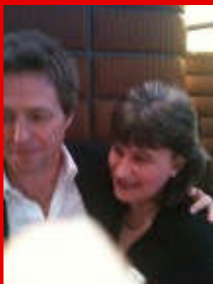
Sophie and Hugh Grant at the Museum of London

Digital Posters: a way of displaying complex information in an eye catching way.