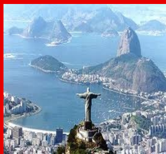
HTAi Annual Conference in Rio

An increasing focus on the value and understanding of emotional labour within team structures is required.