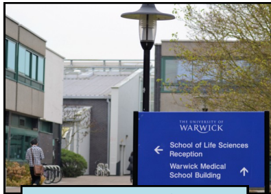
Warwick Medical School