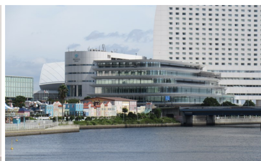
National Convention Hall, Japan