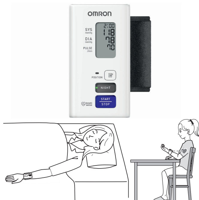
Figure 2: The NightView Blood Pressure Monitor