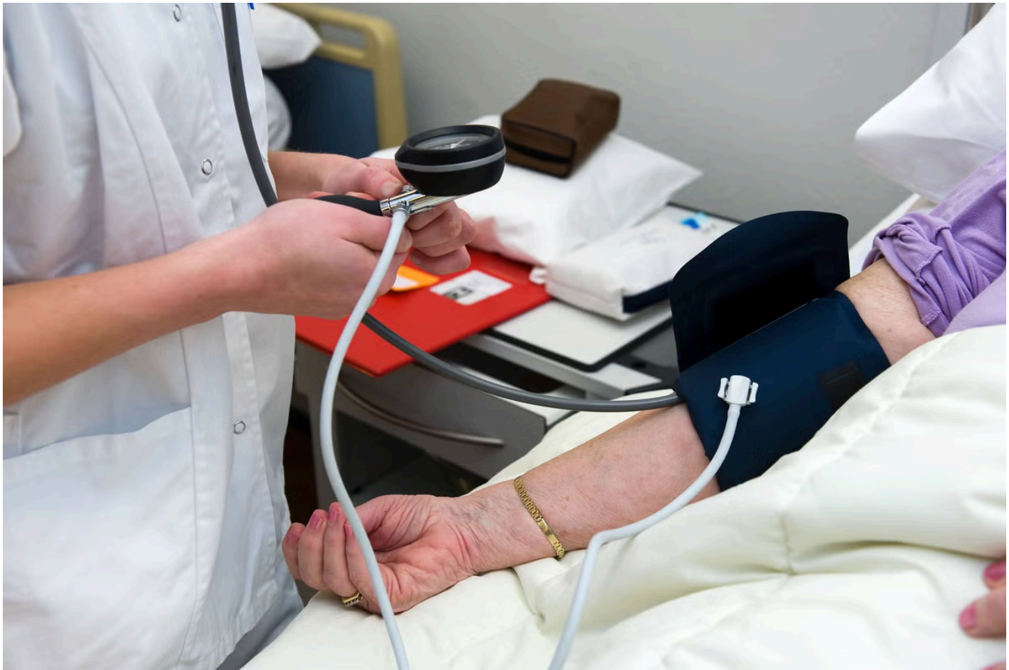
Research suggests aligning the time a patient takes their blood pressure medication with their body clock