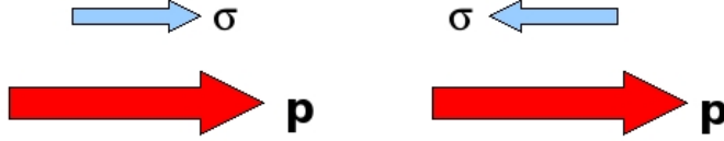
Figure 1: The two helicity states. On the left the spin vector is aligned in the direction of motions of the particle. This is a right-handed helicity state and has helicity +1. On the right the spin vector is antiparallel to the particle momentum. This is a left-handed helicity state with helicity -1.

and has eigenvalues equal to +1 (called right-handed where the spin vector is aligned in the same direction as the momentum vector) or -1 (called left-handed where the spin vector is aligned in the opposite direction as the momentum vector), corresponding to the diagrams in Figure1.