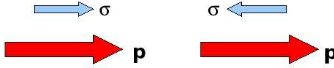
Figure 2: The two helicity states. On the left the spin vector is aligned in the direction of motions of the particle. This is a right-handed helicity state and has helicity +1. On the right the spin vector is antiparallel to the particle momentum. This is a left-handed helicity state with helicity -1.

and has eigenvalues equal to +1 (called right-handed where the spin vector is aligned in the same direction as the momentum vector) or -1 (called left-handed where the spin vector is aligned in the opposite direction as the momentum vector), corresponding to the diagrams in Figure 2.