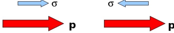
Figure 1: The two helicity states. On the left the spin vector is aligned in the direction of motions of the particle. This is a right-handed helicity state and has helicity +1. On the right the spin vector is antiparallel to the particle momentum. This is a left-handed helicity state with helicity -1.