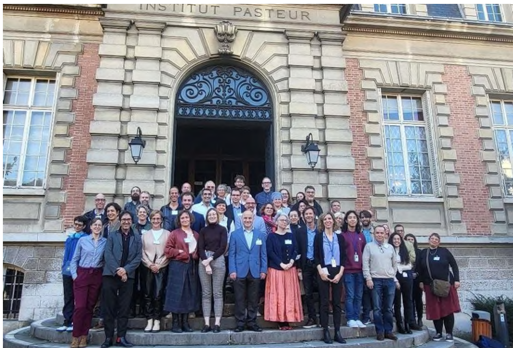
Paris October 2022