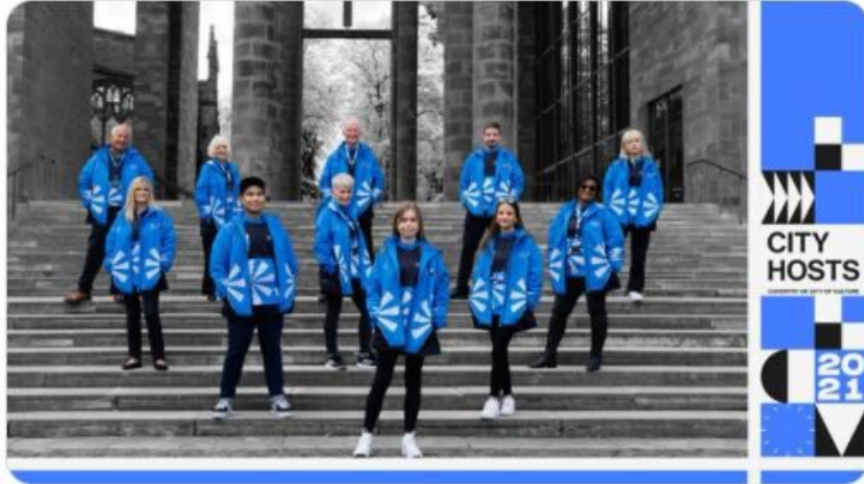
EnV (Coventry) C.I.C and 3 others