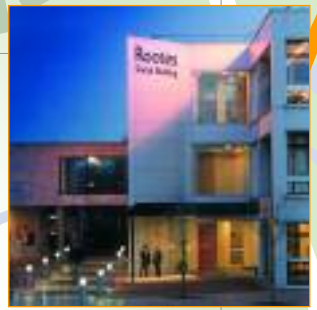
47. Rootes Social Building, Conference Park