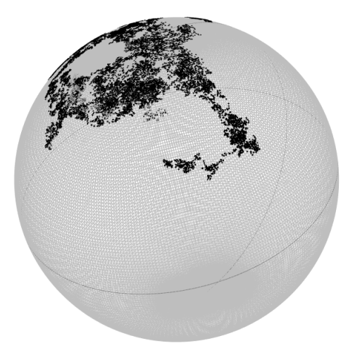
Figure 1-1: A simulation of mass or a gas spreading over the surface of S^2 , based on a branching Brownian motion.