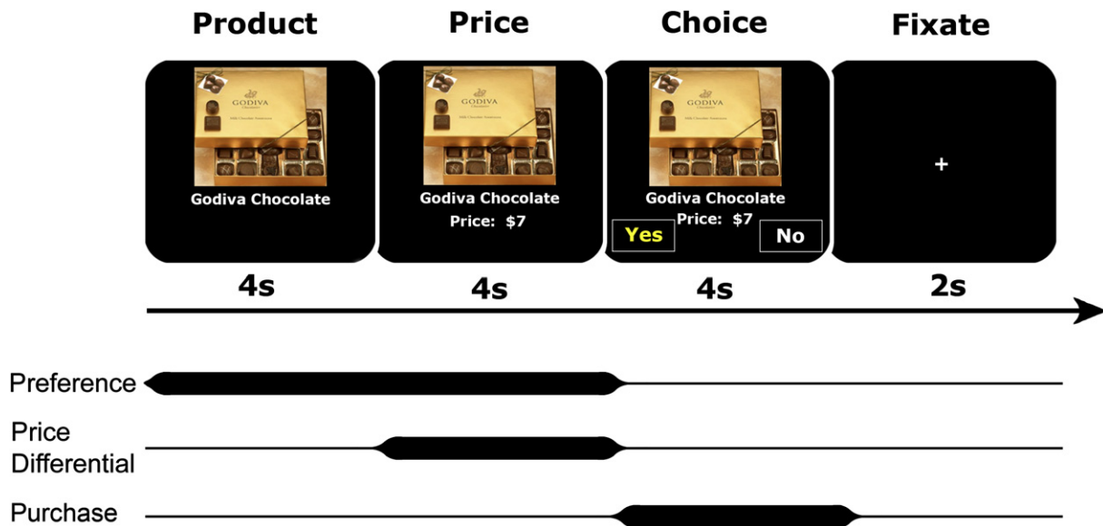
Figure 1. SHOP Task Trial Structure and Regressors

For task structure, subjects saw a labeled product (product period; 4 s), saw the product's price (price period; 4 s), and then chose either to purchase the product or not (by selecting either "yes" or "no" presented randomly on the right or left side of the screen; choice period; 4 s), before fixating on a crosshair (2 s) prior to the onset of the next trial. In regression models, preference was correlated with brain activation during the product and price periods, price differential was correlated with brain activation during the price period, and purchasing was correlated with brain activation during the choice period.