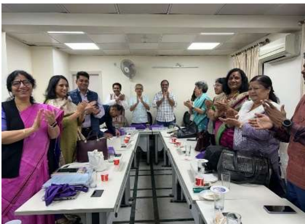
Image 10: RMW1 attendees conclude the workshop with a round of applause