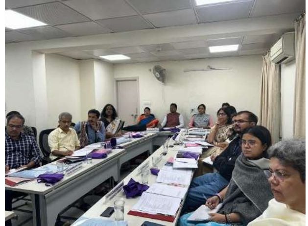
Image 7: Attendees of RMW1 engage with the WAHEI project presentations.