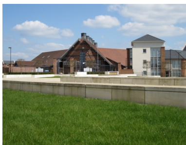
Local primary school