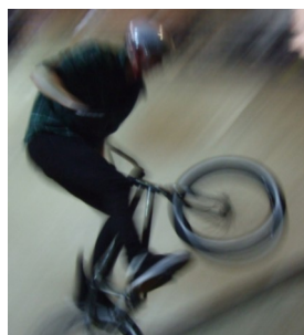
Risk taking at the urban skate park

In addition to the fieldwork being well underway, the team have also been on several trips to give them a broader understanding into various issues related to the project.