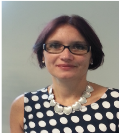
UG T&L Manager S0.96