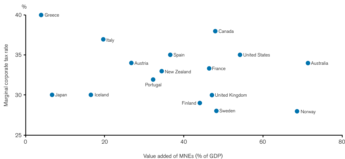
Figure 4: The relationship between the share of multinational capital and corporate tax rates