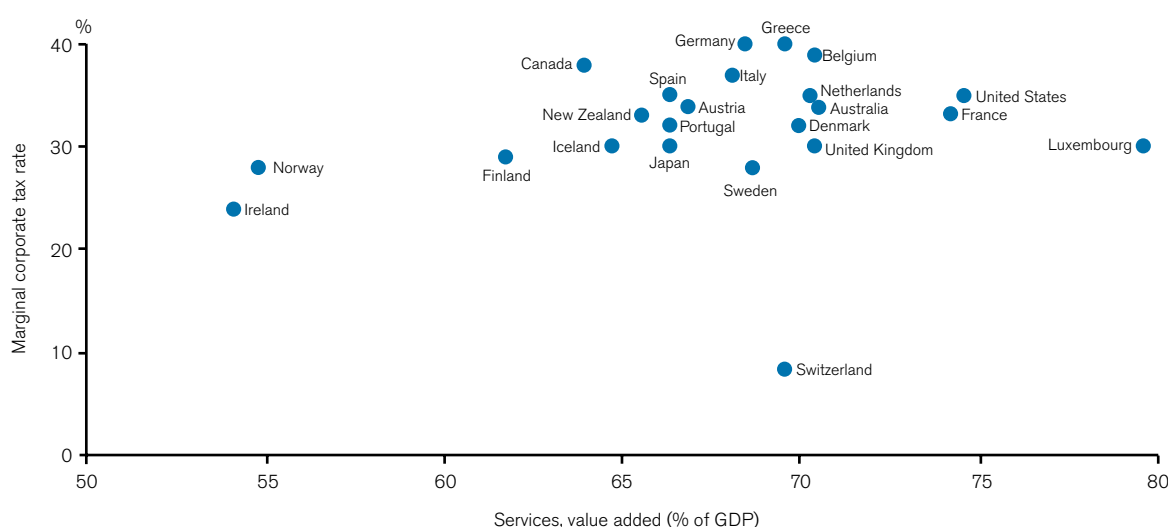
Figure 3: The relationship between the size of the services sector and corporate tax rates in 2000

Sources: World Bank (2000), World Development Indicators ; OECD (2000), National Accounts Statistics .