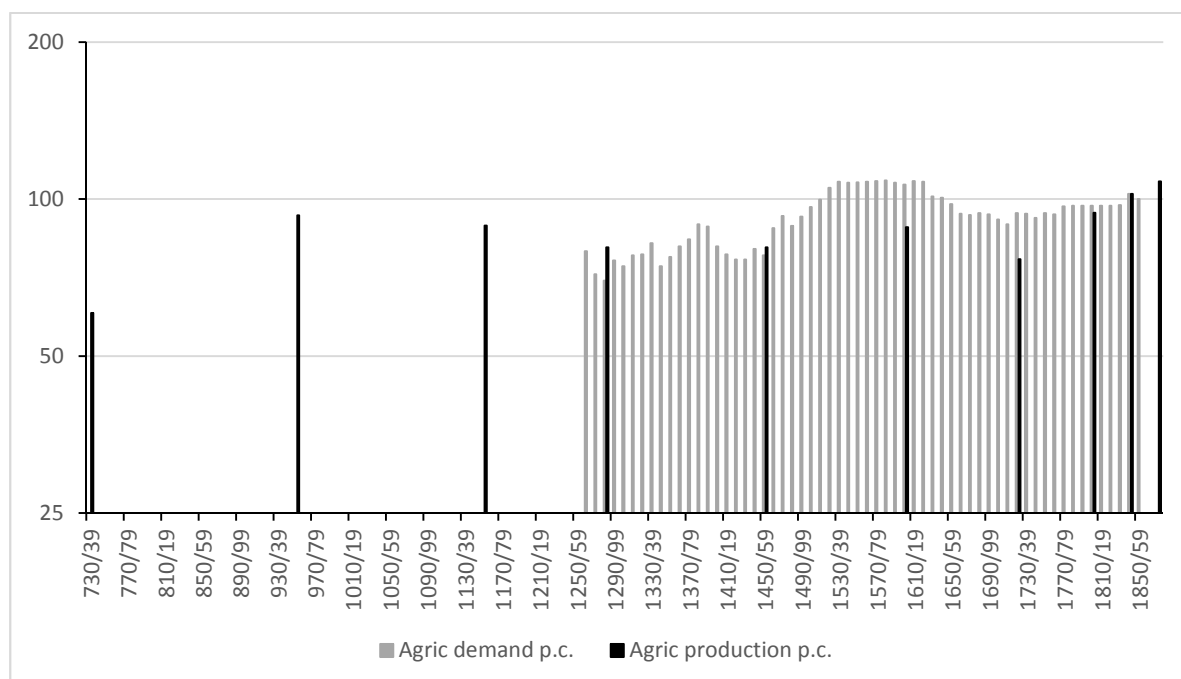
FIGURE 2: Per capita supply of and demand for agricultural products, 730-1874