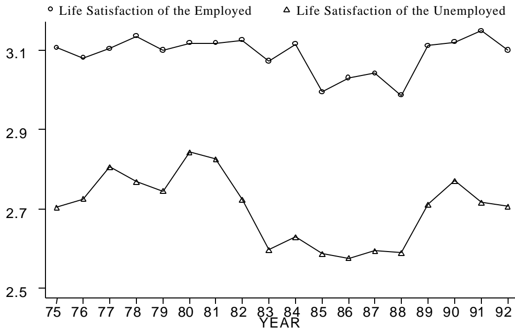
Figure 1: Average Life Satisfaction of Employed and Unemployed Europeans* (based on a random sample of 271,224 individuals).