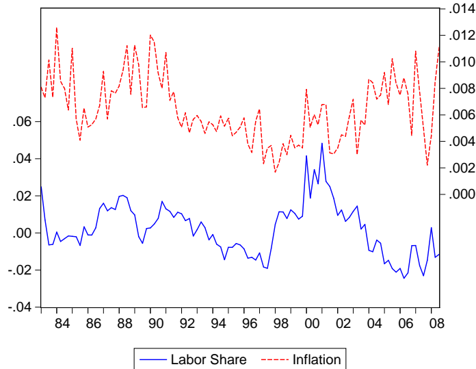
Figure 2: Labor Share and Inflation in the US, 1983:1–2008:3.

Hall 2009). Thus, we use as instrument the variable ‘ Military Spending ’, given by the log of real government expenditure in national defense detrended using the HP-Filter. 13 As a second instrument, we use the variable ‘ Oil Price Change ’, given by the log difference of the spot oil price. The instrumental variables are adjusted using the following transformation guaranteeing positiveness: Z_+ = Z - \min(Z) . The complete instrument list includes the variables ‘ Military Spending ’, ‘ Oil Price Change ’, and the unit vector, yielding p = 3 instruments and 6 moment conditions overall.