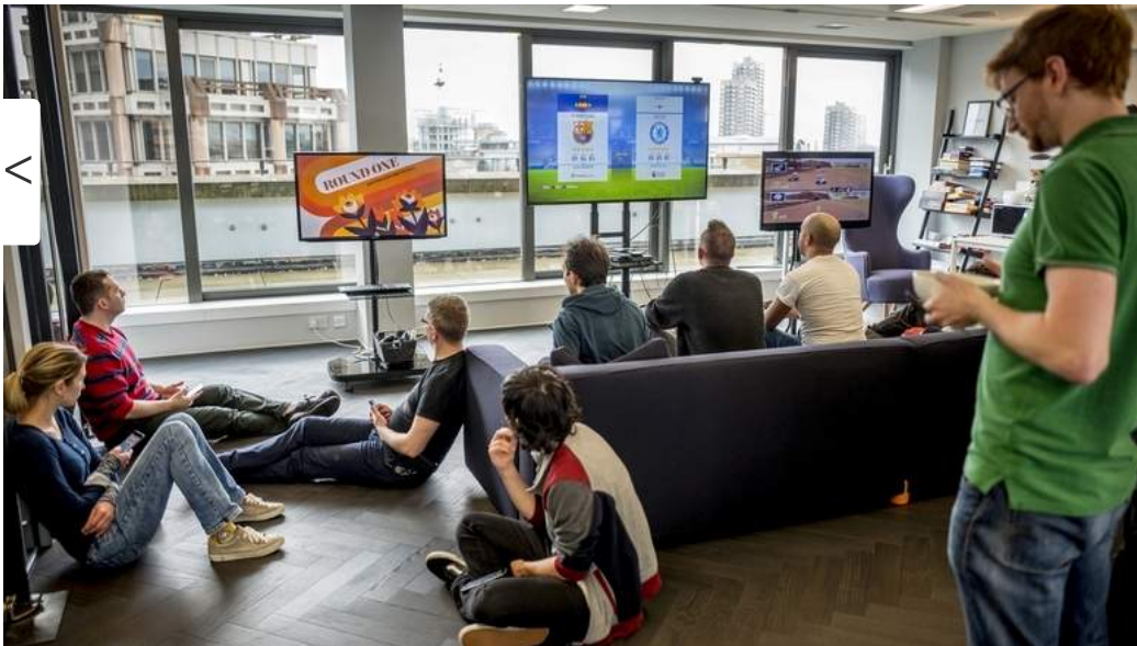
It is recommended to have a corner of an office designated as an area to relax away from one's desk.

Filed on November 7, 2018 | Last updated on November 7, 2018 at 09:22 pm