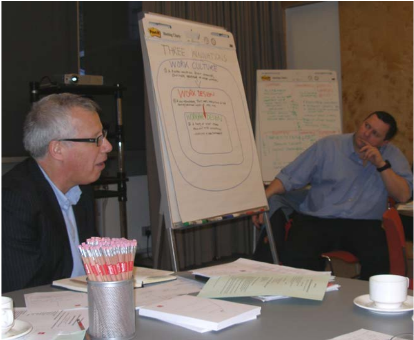
A visual reminder of our meeting