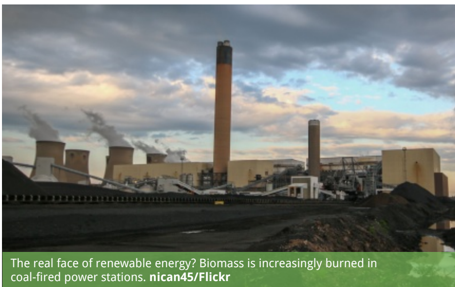
The real face of renewable energy? Biomass is increasingly burned in coal-fired power stations.

Furthermore, wood bioenergy can provide 'baseload' power (24/7, year round), thus putting off the need to invest in the electricity storage and interconnectors which are needed to make 100% 'no-burn' renewables viable. In addition, public sentiment towards burning wood as renewable energy has been favourable. It is viewed by the public and even environmentalists as 'natural'. Many environmental organisations initially promoted biomass enthusiastically, even those that later shifted their position on ethanol as competition with food production was recognised. With mandated targets and subsidies in place, it seemed clear that wood biomass would be the 'low hanging fruit' for renewables and would rapidly expand on a large scale. And it has.