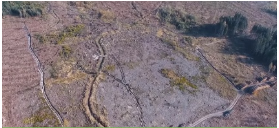
Damage to wetland environments caused by logging. Koalice pro řeky

The production of wood biomass is also a pressing concern. Remains of