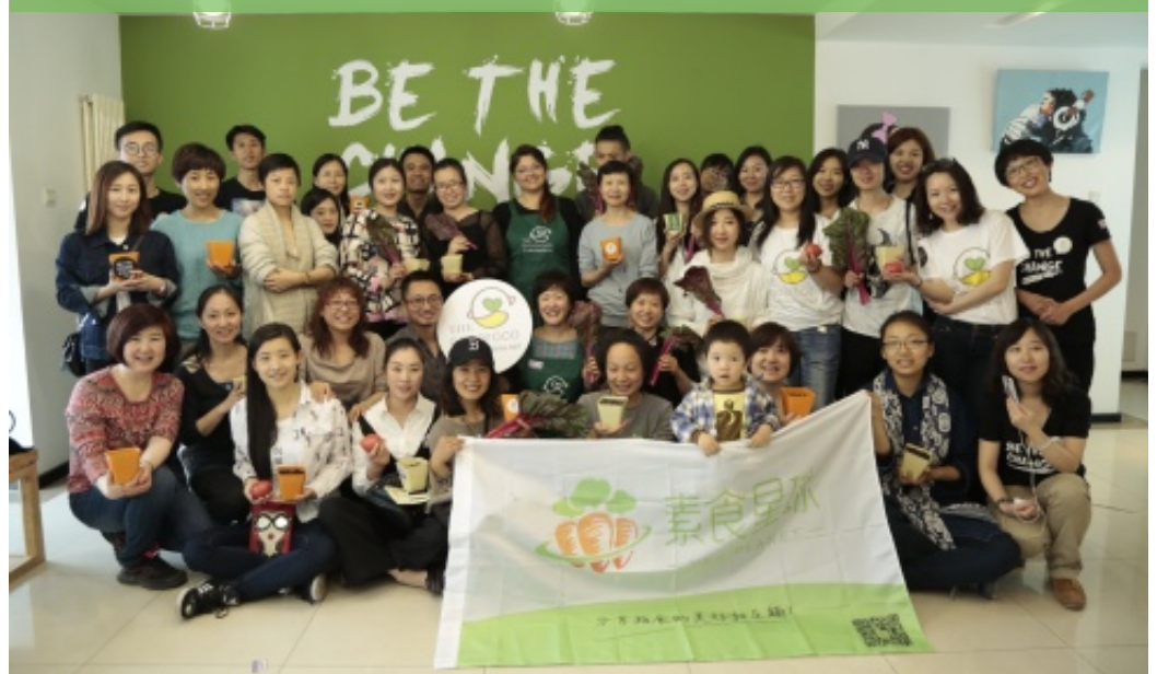
The Good Food Roadshow team with participants at one of the workshops in Beijing. Brighter Green

factory farming” linking the world’s three biggest players in the meat industry—the US, China, and Brazil—and analysing the dynamics shaping this triangle. These dynamics include industrial-scale cattle ranching and growing soybeans for animal feed, which contribute to extensive deforestation in countries such as Brazil and Paraguay.