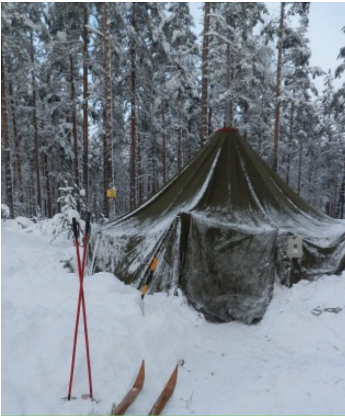
A tent for volunteers protecting the Ore Forest Landscape. Pär Wetterrot