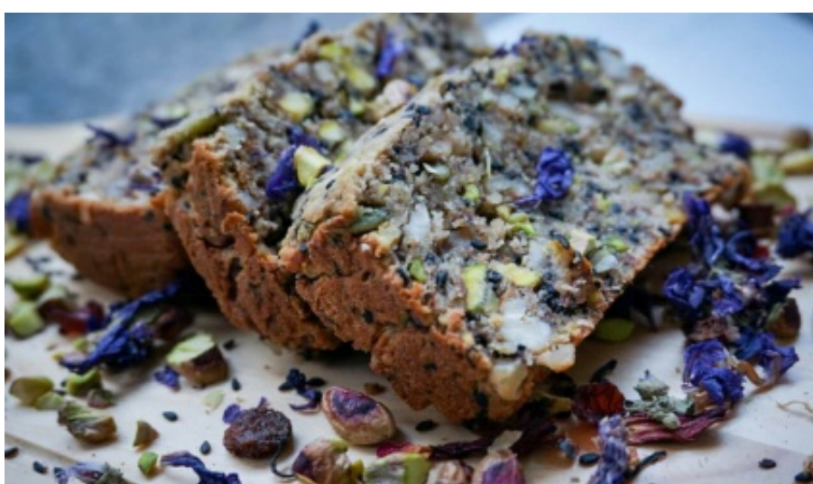
Vegan Energizing Nutty Bread made with local ingredients at Good Food Roadshow workshop in Taipei. Brighter Green