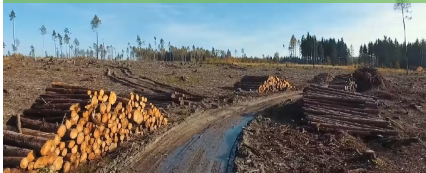
Logging in spruce forests increases soil erosion. Koalice pro řeky

Soil erosion is a serious problem, with 67% of our arable soil endangered by erosion, and 21 million tons of topsoil lost due to erosion every year. Oilseed rape farming loomed, and after the transition to free market economics in 1990 we started to export biofuel