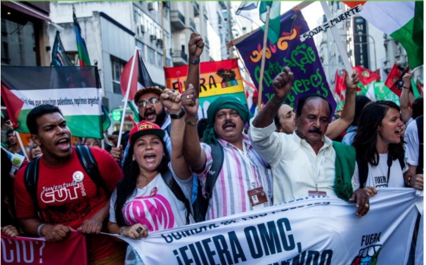
Protesters target the WTO in Buenos Aires, Argentina. FueraOMC

dispossession of land of communities, forest dependent peoples and Indigenous Peoples, as well as human health and animal welfare impacts. [2] For example, the 2016 State of the World's Forests report refers to an analysis in seven South American countries which found that 71% of deforestation between 1990 and 2005 was driven by increased demand for land while in Brazil the figure was even higher, at 80%.