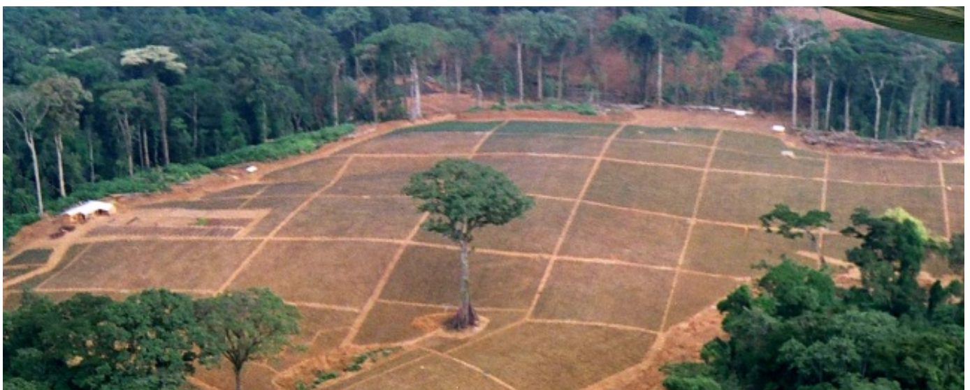
A newly-planted palm oil plantation in Cameroon. Center for Environment and Development