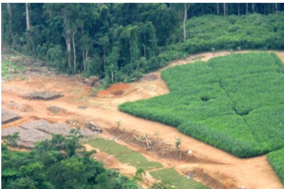
Deforestation for palm oil in Cameroon. Center for Environment and Development

The deal was obviously not a good one for the Cameroonian State, and NGOs were openly questioning why future land cessions should follow the path of the SGSOC concession. The conclusion of our findings was that the laws in Cameroon were not strong enough to regulate this new rush for lands. The legislation should include clearer provisions to protect the rights of communities and give them the priority over land and natural resources management. Environmental standards should be drastically improved as well, together with standards that protect the national development interests of the State.