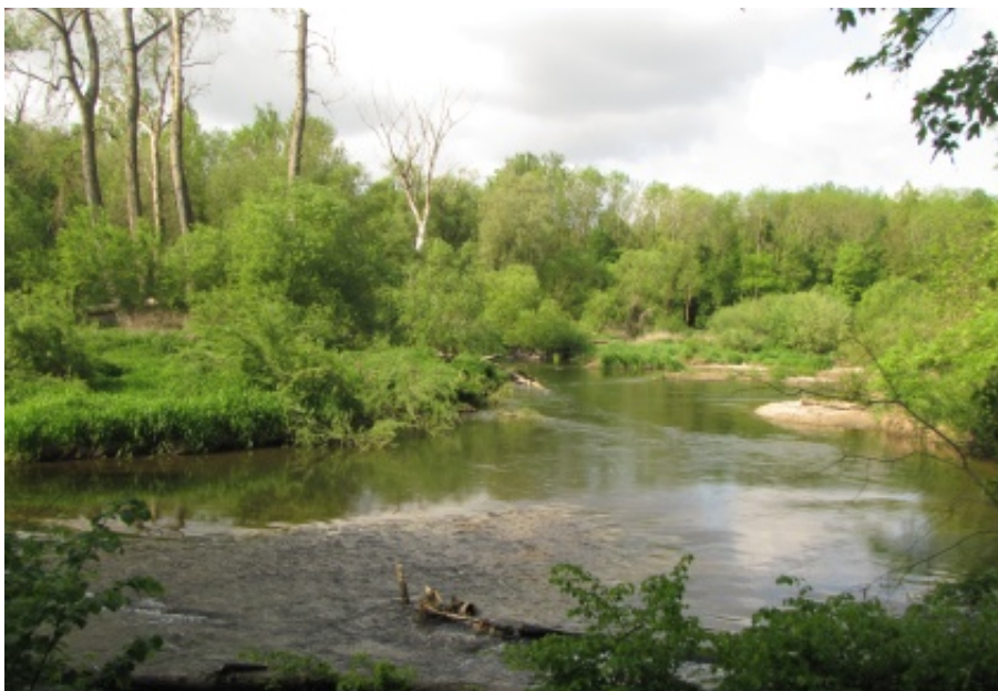
A natural floodplain. Koalice pro řeky