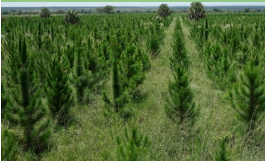
Monoculture tree plantations shouldn't be classed as forests. Carbon Violence

ignorance about forest ecology are the tools of the trade for forest and biomass industries eager to unravel forest protections. For example, the Trump administration recently introduced a “Resilient Forests Act”. Behind the nice sounding