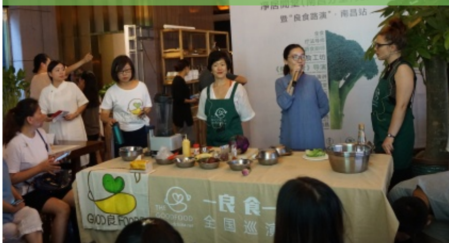
The final Good Food Roadshow workshop in Nanchang. Brighter Green