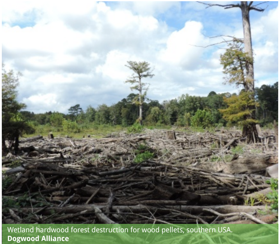
Wetland hardwood forest destruction for wood pellets, southern USA.

bottomland hardwood forests. [4] According to the Southern Environmental Law Center, over 168,000 acres of wetland forest were at high risk from just this one facility. [5] Enviva ships much of the pellets they produce to the DRAX coal plant in UK, which has been converted to burn 50% wood pellets. In 2016, DRAX burned 6.6 million tonnes of pellets, [6] made from 13.2 million tonnes of wood (since two tonnes of wood are harvested for every tonne of pellets manufactured).