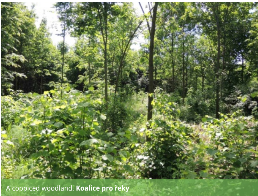
A coppiced woodland. Koalice pro řeky

wood on the spot in the damaged mountain catchments, to prevent soil erosion, enhance soil fertility, and enable stream and wetland restoration. Our mountain forests should be protected.