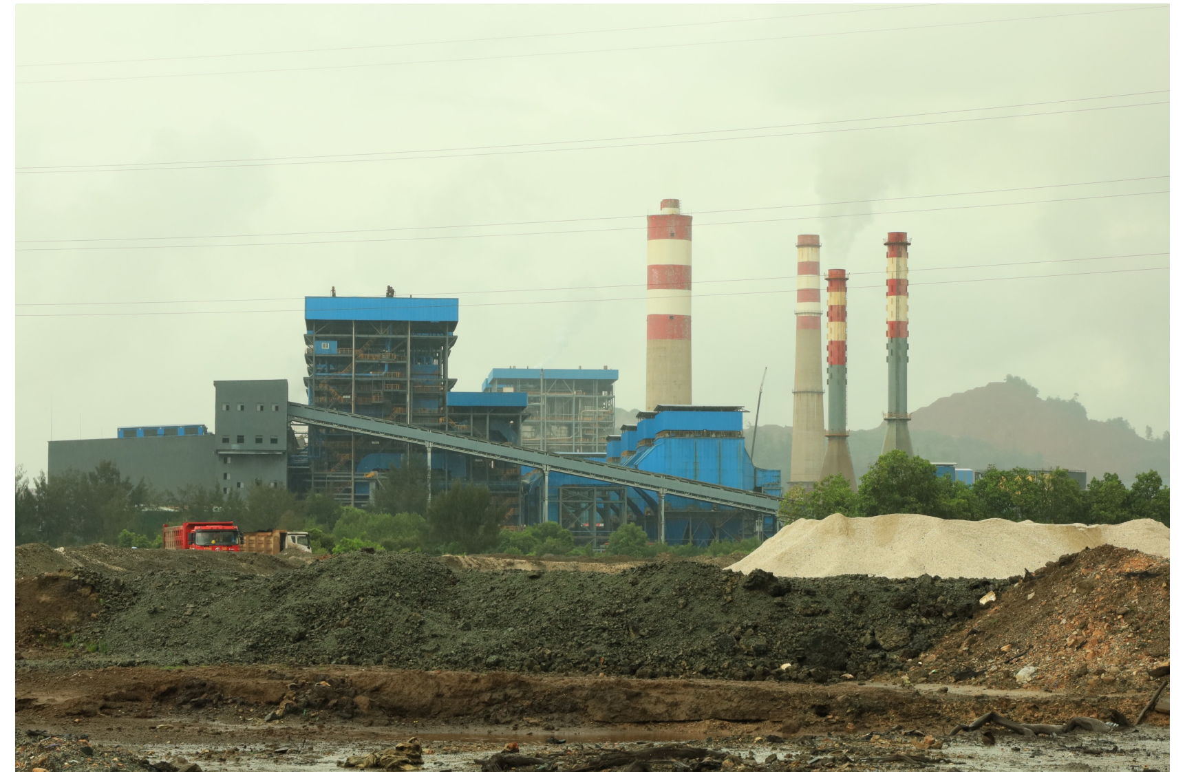
Photo: Celios documentation when visiting Konawe, Sulawesi June 2024. Captive Coal Power Plant is booming and damaging air quality

Increases safeguard on environment, community, and workers