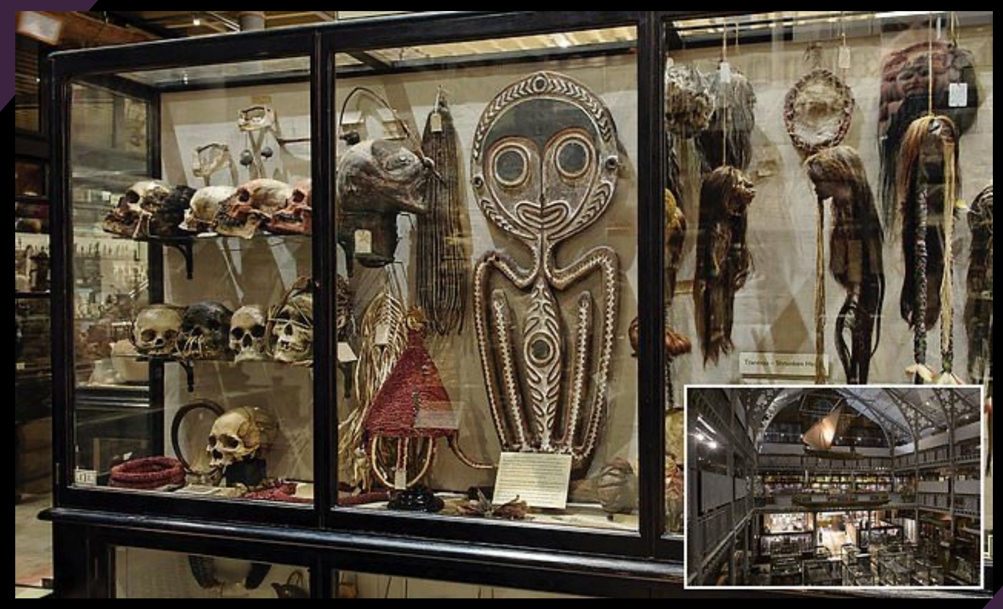
Oxford Pitt Rivers Museum