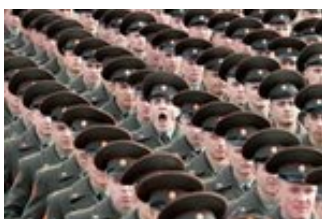
Hilarious photos taken at the right moment (Perfectly Timed Pictures)