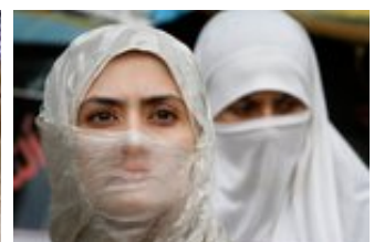
Inside The Minds Of Russia's Black Widows (The Daily Beast)