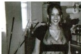
The painful lesson of the Cherice Moralez rape trial 03 Sep 2013