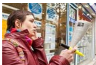
Should you rent or buy? (Money Advice Service)