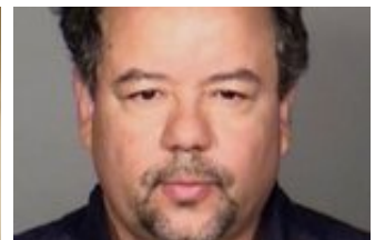
Cleveland kidnapper Ariel Castro found hanged after one month in jail 04 Sep 2013