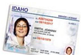
Your Driver's License Is Obsolete (CSC)