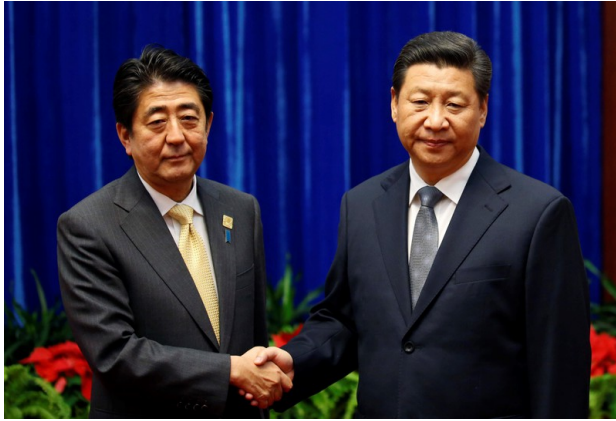
Abe-Xi summit in November 2015: who is encircling whom?