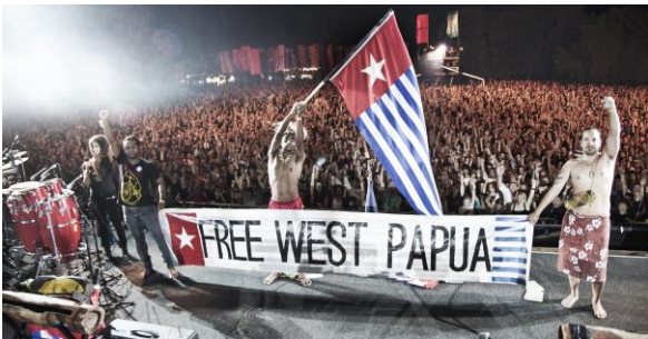
Music group Blue King Brown raise a banner in support of West Papua at a performance in Australia, 2012

Despite making strong statements of solidarity for Papuans in the past, Papua New Guinea's President did not support Papua's application to be given more than observer status at the MSG, but did support Indonesia's application to be given associate membership. Fiji's Prime Minister, Frank Bainimarama adopted the same position. 204 The decision was preceded by intense diplomatic efforts on the part of Indonesia, which are believed to have included promises to support the economic development of Melanesia. 205