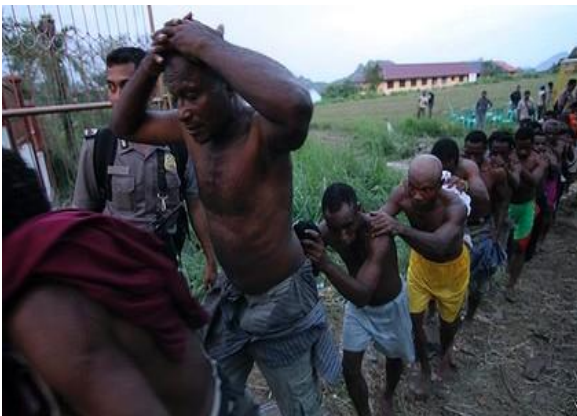
Papuans rounded up at gunpoint by Indonesian police, 2011

Underlying the human rights abuses in West Papua is the fact that the region is de facto controlled by the Indonesian military. It is estimated that around 15,000 troops are currently deployed in the West Papua region. 108 Military forces have to partly fund their own salaries, and they have strong economic interests in Papua, both in legal and illegal business. They are involved in mining and logging, as well as illegal activities such as alcohol, prostitution, and extortion. 109