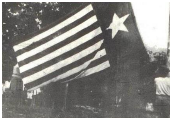
The West Papuan flag being flown at the Victoria Barracks in West Papua on 1st July 1971 when the OPM (Free Papua Movement) proclaimed Independence.

The Organisasi Papua Merdeka (OPM) is a pro-independence organisation, which launched its operations against Indonesia in 1965. 83 In the 70s, the movement gained strong support in the highlands. In order to attempt to quell this movement, the Indonesian military engaged in extremely violent operations, leaving thousands of civilian victims behind.