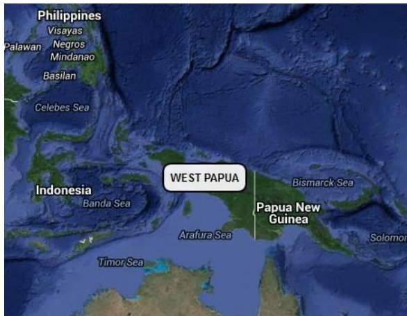
Location of West Papua region of Indonesia

The area including the Indonesian provinces of 'Papua' and 'West Papua' (referred to collectively as 'the West Papua region' or 'West Papua' in this report) covers the western part of the island of New Guinea and borders Papua New Guinea to the east. 1 The area became part of the Dutch colonial territory known as the Netherlands Indies in the 19th century. When the Netherlands Indies gained its independence as Indonesia in 1945 (internationally recognised in 1949), disagreements ensued between the newly formed country and the Netherlands on whether West Papua should be part of Indonesia. Tension escalated and open conflict broke out between the two states.