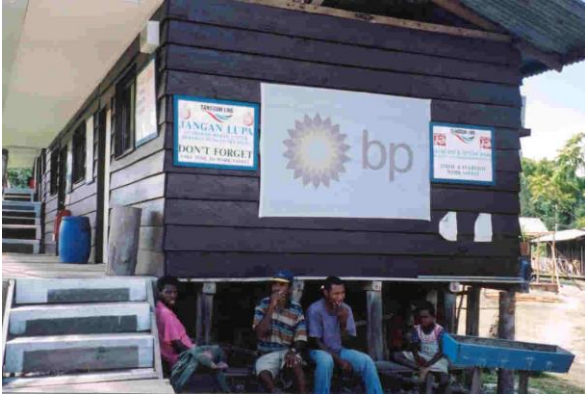
BP Tanggung camp in early stages of development

from the 'Tanggung Independent Advisory Panel' (TIAP). 168