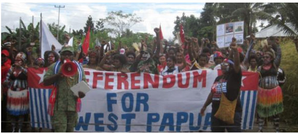
Papuans in Timika call for a referendum

An important part of Papuan grievances are linked to the 1969 Act of Free Choice, which, as highlighted in Section 1, is widely reported to have been a coercive and unrepresentative exercise that was orchestrated to ensure continued Indonesian control over Papua. Because of this, several Papuans and supporters of the Papuan struggle ask for a second consultation to take place. 256