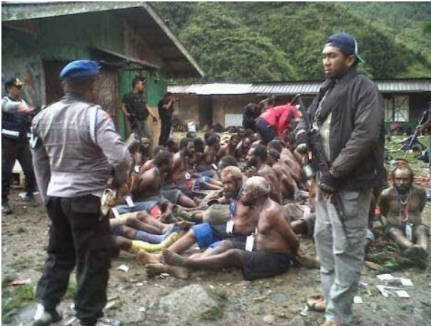
Indonesian police rounding up West Papuan villagers in the Timika area, near the Grasberg mine, 2015