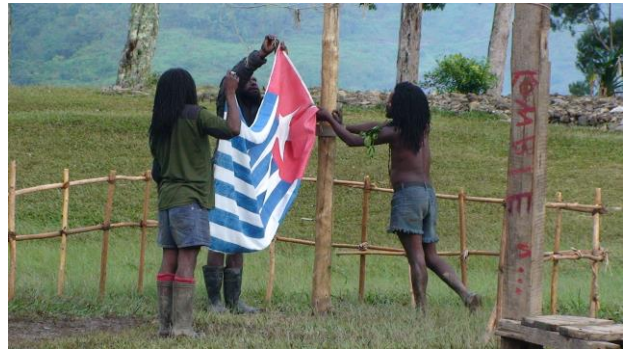
Papuans with illegal Morning Star Flag

International commented that 'rather than identifying and bringing to justice the individuals responsible for the attacks on the logging companies, the operation appears to have turned into a campaign of revenge against the immediate community and beyond'. 95