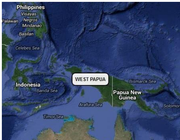
Location of West Papua region of Indonesia

The area including the Indonesian provinces of ‘Papua’ and ‘West Papua’ (referred to collectively as ‘the West Papua region’ or ‘West Papua’ in this report) covers the western part of the island of New Guinea and borders Papua New Guinea to the east. 1 The area became part of the Dutch colonial territory known as the Netherlands Indies in the 19th century. When the Netherlands Indies gained its independence as Indonesia in 1945 (internationally recognised in 1949), disagreements ensued between the newly formed country and the Netherlands on whether West Papua should be part of Indonesia. Tension escalated and open conflict broke out between the two states.