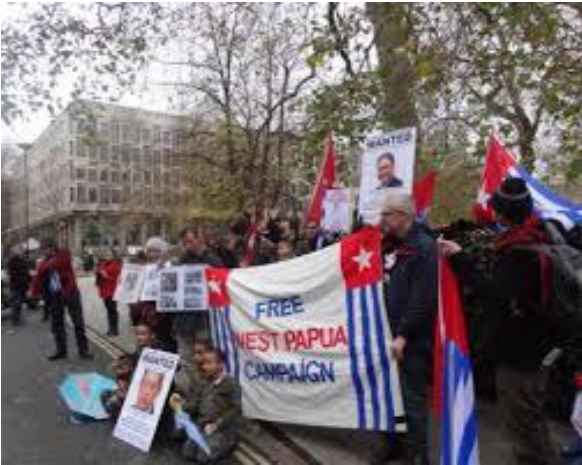
Free West Papua Campaign demonstration in London

As described in the preceding section, British companies, including most importantly BP, operate in West Papua. Britain has strong economic and political ties with Indonesia: the UK is Indonesia's fifth largest foreign investor, and during his visit to Indonesia in 2015, Prime Minister David Cameron promised up to £1bn to help finance infrastructure development. 233 During the same visit Cameron also agreed to measures to counter the terrorist threat posed by ISIS. 234 Britain also enjoys a good reputation with the Indonesian public: 65% of Indonesians view Britain's influence positively (and only 15% have a negative opinion). 235