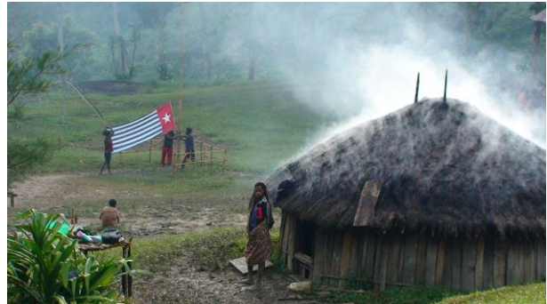
House in Wamena region with illegal Morning Star Flag

the displacement of hundreds more. Amnesty International commented that 'rather than identifying and bringing to justice the individuals responsible for the attacks on the logging companies, the operation appears to have turned into a campaign of revenge against the immediate community and beyond'. 100