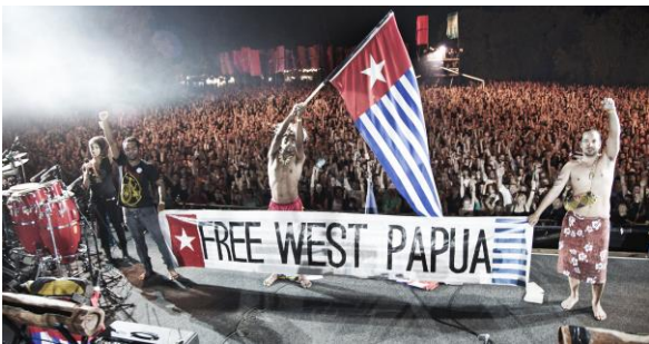
Music group Blue King Brown raise a banner in support of West Papua at a performance in Australia, 2012

Despite making strong statements of solidarity for Papuans in the past, Papua New Guinea's President did not support Papua's application to be given more than observer status at the MSG, but did support Indonesia's application to be given associate membership. Fiji's Prime Minister, Frank Bainimarama adopted the same position. 209 The decision was preceded by intense diplomatic efforts on the part of Indonesia, which are believed to have included promises to support the economic development of Melanesia. 210