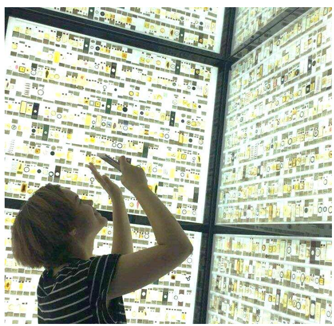
Own photo (2017) showing myself taking a photo at the 'Micrarium' in the Grant Museum of Zooology, one of UCL's many museums as part of a summer school.