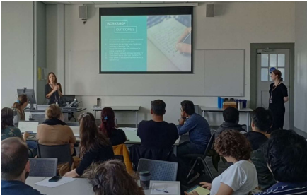
Research Development Facilitators deliver workshop, May 2023

At the University of Liverpool, we, as Research Development Facilitators, have led an effective programme to support colleagues through this transition. Through this programme, we have drawn on our community's experiences to facilitate an inclusive and accessible collective living knowledge .