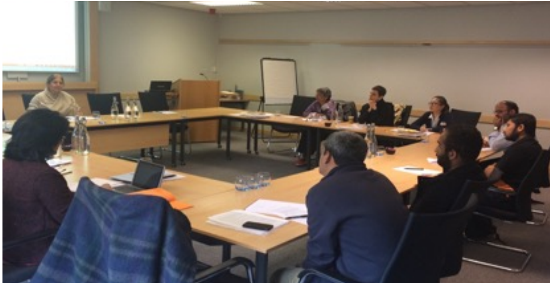
Prof Shaheen Sardar Ali

In her presentation, Prof Ali asked the question: Are quotas an ‘artificial’ tool for raising women’s representation in Parliament? Or, if we are patient and consistent, the presence of a ‘critical mass’ over the years may make the presence of women a ‘habit’? Working with the example of quotas for women in Pakistan, Prof Ali noted that while quotas seats were regarded as of lesser order, the increase in the number of women in parliament meant that they were able to form alliances on specific issues across party lines. Quotas allowed the politics of presence, which is important in Pakistan’s complex political situation.