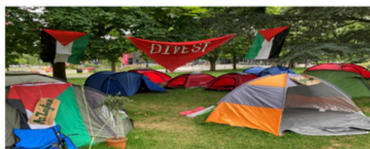
Figure 1: Antiwar Demonstration Tents in the University of Warwick

In the contemporary Eurasia, peace-making interconnectedness between 'antiwar sentiments in Ukraine' and 'antiwar sentiments in Gaza' is still under construction. Since both Ukraine War and Gaza War have profound impacts on the entire global society, this article argues the controversial cleavage between 'exclusive European affairs' and 'exclusive Asian affairs' in such a geographically connected Eurasia. In order to bridge cultural heritages between Europe and Asia, it makes efforts to combine the Zen Master's triple levels with Hegelian three-paragraph dialectics, presenting the correlations. In particular, three-level dialectical logic of mind mapping addresses each stage with the effect of thesis, antithesis, and synthesis, respectively. Most importantly, I have provided conceptual visual aids as well as making examples of well-known incidents to assist the readers for a better understanding of the above ideas. Hopefully, it may bring new light on relevant studies for epochal oriental-occidental academic exchanges, especially on the feedback to the query 'how are society and culture understood and experienced in the contemporary world?' through my approach of dialectics-associated mindfulness.