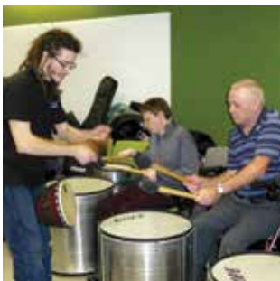
Warwick Volunteers in Kenilworth