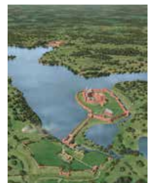
What Kenilworth Castle with the mere restored might look like.

Warwick students have been using their time and expertise to carry out innovative research that has real-life relevance for the town. As part of their studies, students from Warwick Business School carried out a detailed study into the practicalities of re-flooding Kenilworth Castle's grounds to recreate the historic mere and found the best way to bring in revenue could be to include a hotel or leisure complex.