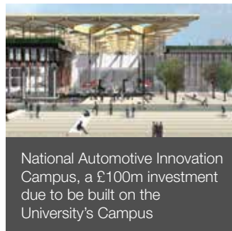
National Automotive Innovation Campus, a £100m investment due to be built on the University's Campus

SQW – University of Warwick Regional Impact Study, 2013