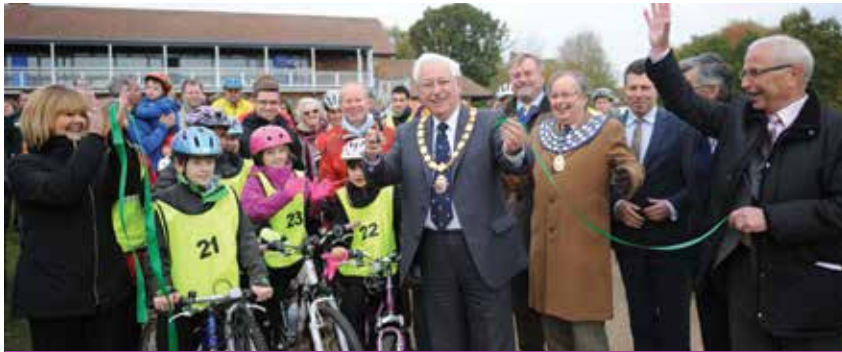
The Connect 2 Kenilworth (C2K) cycle and pedestrian route that joins up Kenilworth and the University campus opened in 2012

Warwick Arts Centre is the second largest arts centre in the UK. 62% of visitors come from Coventry and Warwickshire. It hosted 494 individual performances, with an annual audience of 270,000 in 2010/11. An independent study estimated the total value to the local community from the Arts Centre to be £27.7 million.