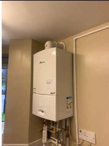
Warning Label 'if Applicable'