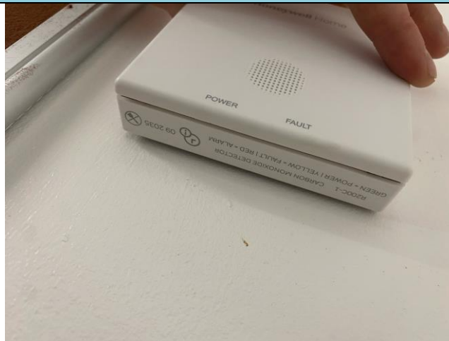
Location of CO Alarm