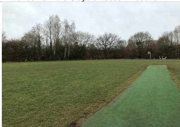
Photo taken from the South of the site.