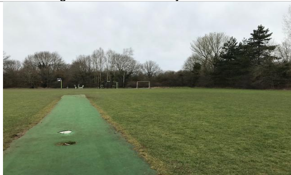
Photo taken towards the North of the site.