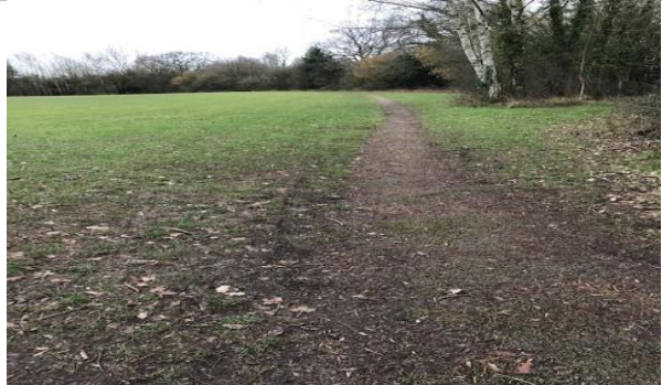
Path along the West boundary.