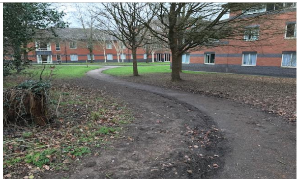
Entrance from the Claycroft accommodation