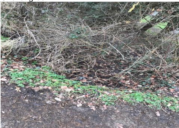
Trench to main entrance from Claycroft accommodation