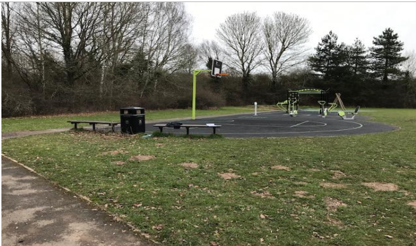
Gym equipment in the North.