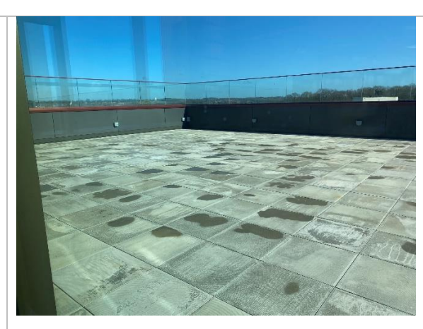
Main balcony area shown from classrooms that clearly shows edge protection, electrical point and ground area.