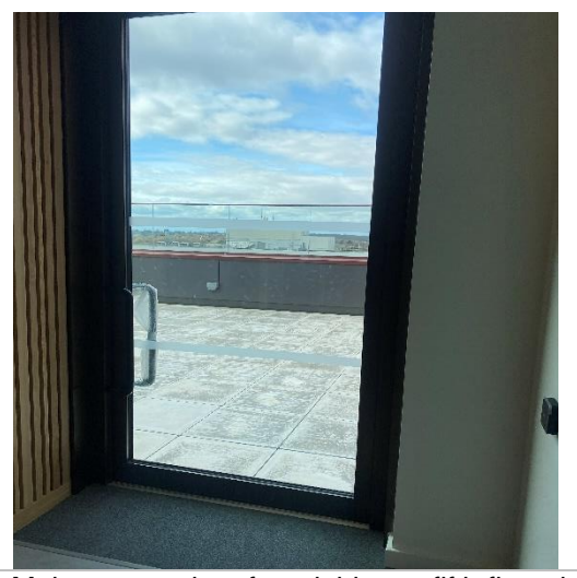
Main access door from lobby on fifth floor that and Salto access.