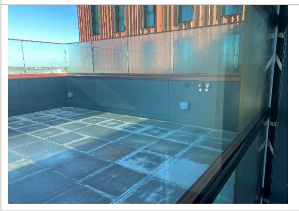
Fire detection point devices situated near main access door to balcony.