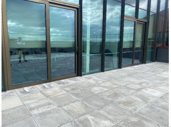
Double access doors that leads out from either classrooms or an open function space.