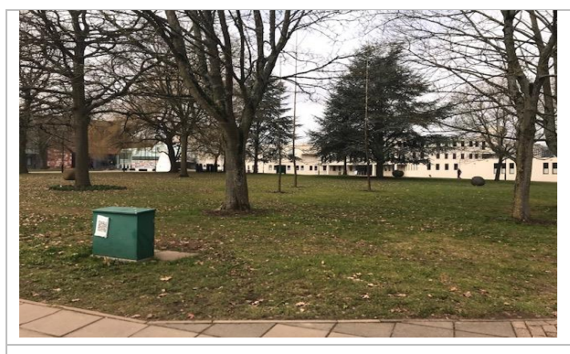
Green space to the left of Senate House as you exit the building