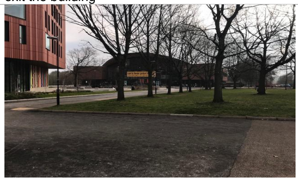
Path alongside Faculty of Arts building leading to the Oculus