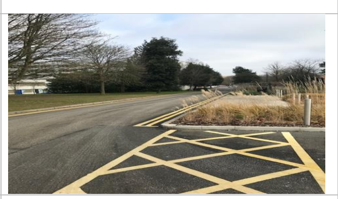
Road located next to the site from the Spinal route