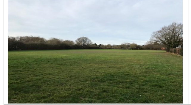
Frisbee Field, taken from North side.

Container unit integrated into the boundary.