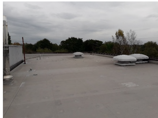
Flat roof walkway and plant