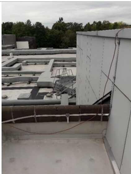
Flat roof walkway and plant