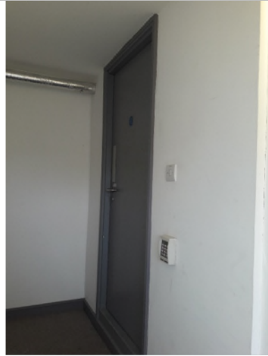
Maintenance side staircase