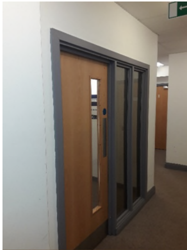
First floor internal access door