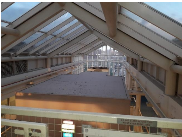
Gantry accessways over plant