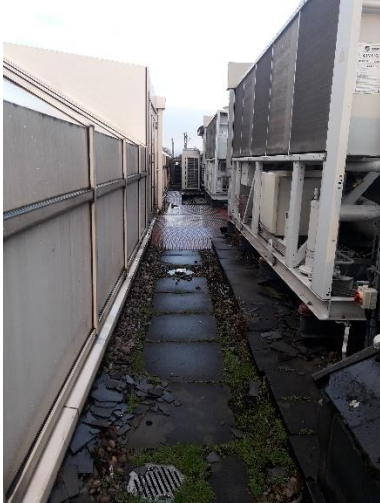
First floor internal access door