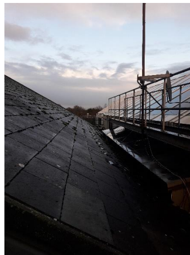
Flat roof walkway and plant