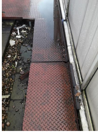
Maintenance side staircase