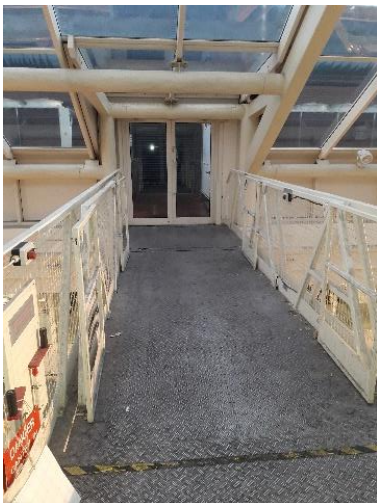
Roof access door