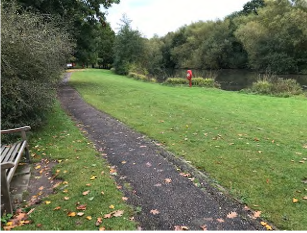
Between Tocil Lakes and Bluebell residences