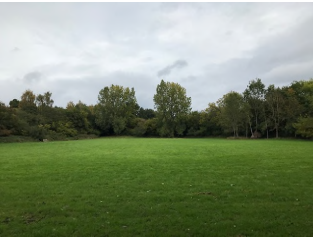
Claycroft field for recreation