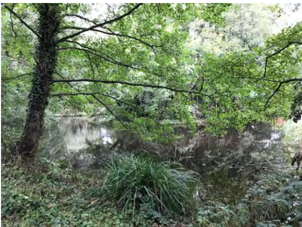
Pond between Claycroft field and Claycroft residence