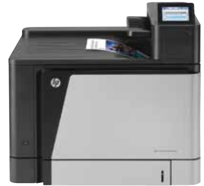
HP Color LaserJet Enterprise M855dn Printer

Mobile printing capability: 11 HP ePrint; Apple AirPrint™; Mobile Apps; HP Wireless Direct printing (optional)