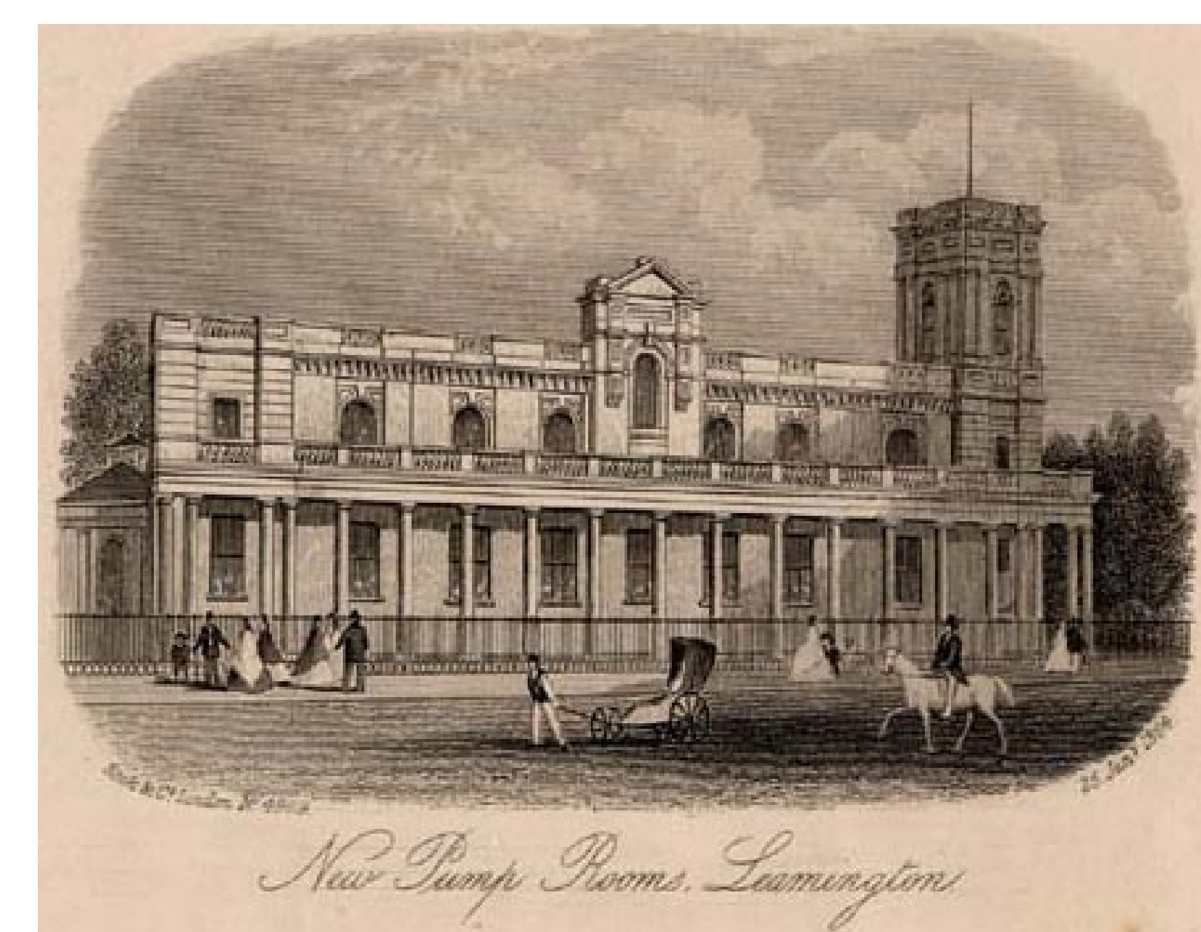
Leamington Spa Art Gallery and Museum No. m0937p000n2