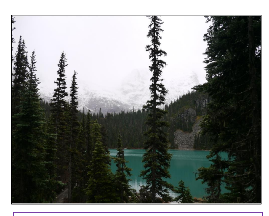
Winner of Photo Competition, October 2022

Sign up to be first to hear about short international experiences and funding