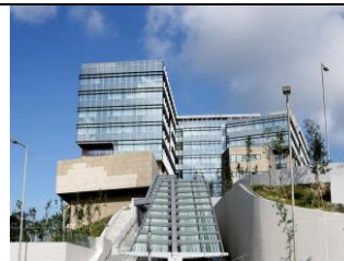
Photo: Lee Shau Kee Business Building